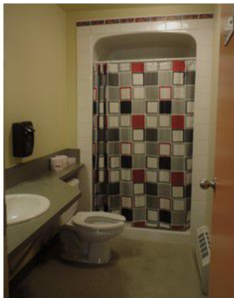
Youth building Bedroom and Bathroom