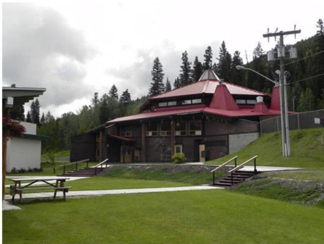
Main Family Building