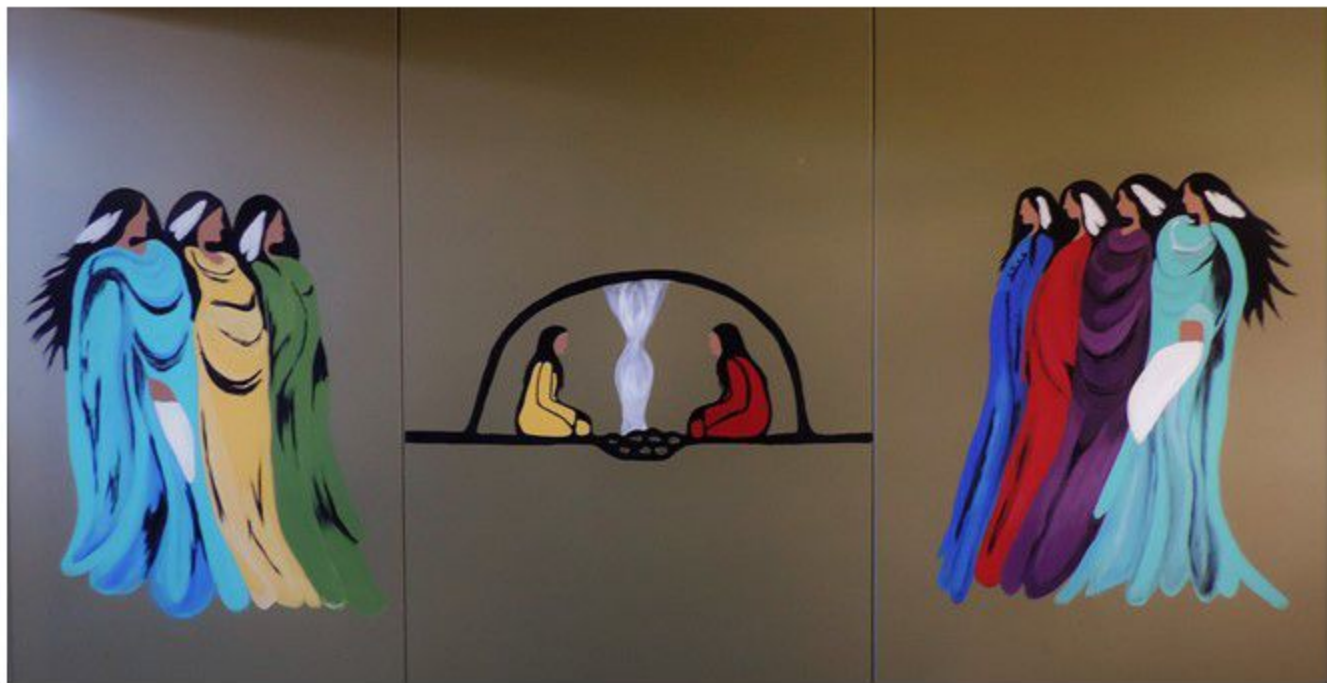
Youth building Wall Mural