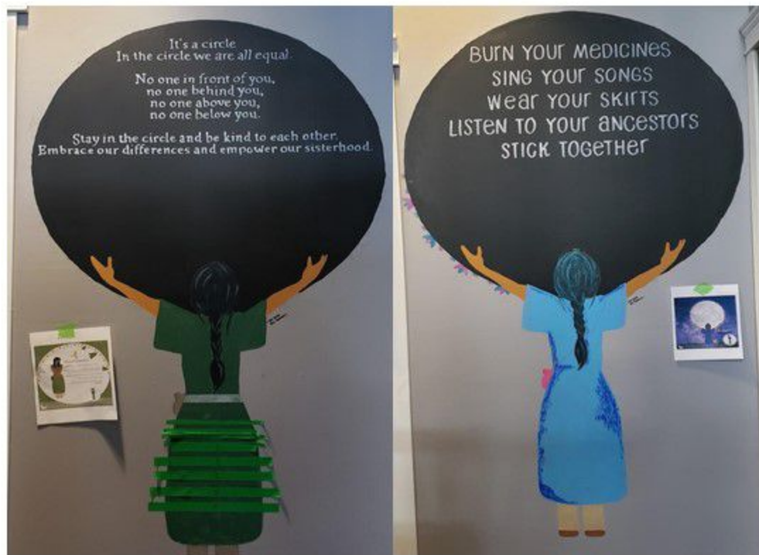
New Wall Art