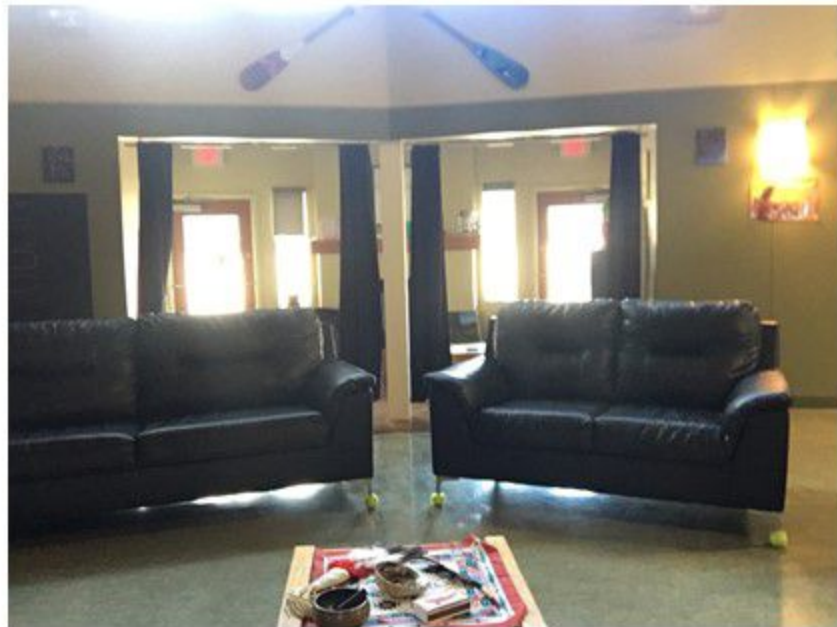
Youth kitchen,dining, and common area