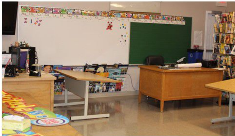
Family Program Classroom