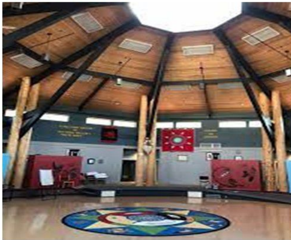
Main Family Building