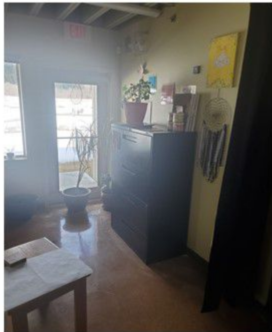
Youth Building, Fireplace and reading Nook